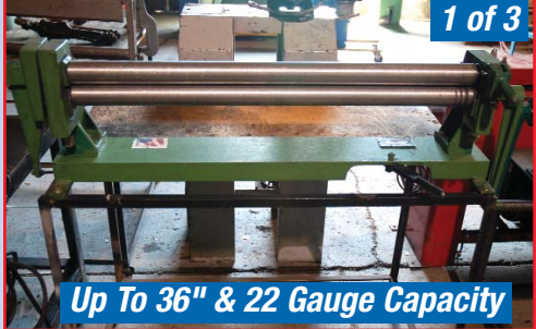
TENNSMITH MODEL SR36 SLIP ROLLS