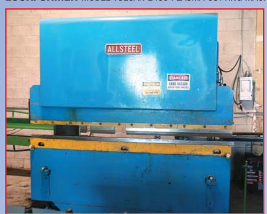
ALLSTEEL 8' X 45 TON PRESS BRAKE