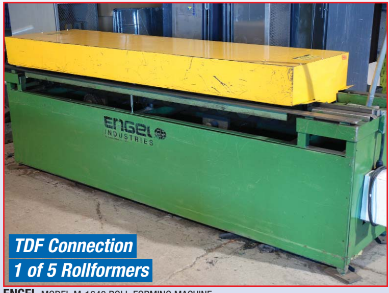
ENGEL MODEL M-1640 ROLL FORMING MACHINE