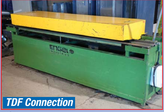
ENGEL MODEL M-1640 ROLL FORMING MACHINE