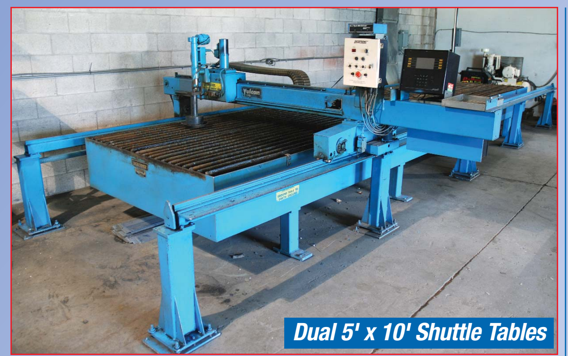
LOCKFORMER MODEL VULCAN 2400 PLASMA CUTTING MACHINE