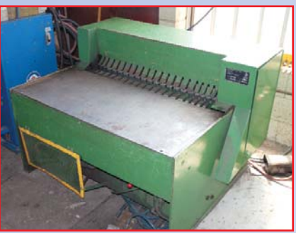
LION SERVICES POWER DRIVE CLEAT BENDER (DUCTWORK) MODEL 1836