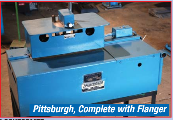
LOCKFORMER 24 GAUGE