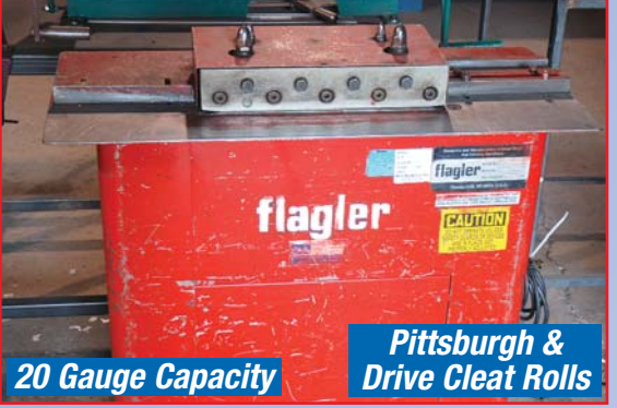
FLAGLER ROLL FORMING MACHINE