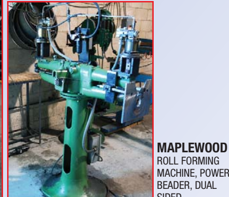
ROLL FORMING MACHINE. POWER BEADER, DUAL SIDED