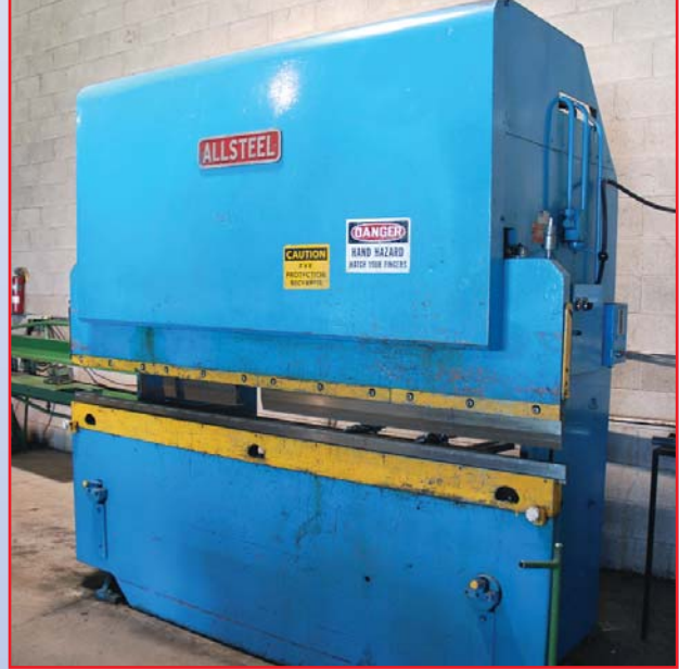
ALLSTEEL 8' X 45 TON PRESS BRAKE