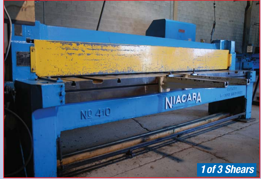
NIAGARA POWER SHEAR MODEL NO 410, 10' X 14 GAUGE CAPACITY