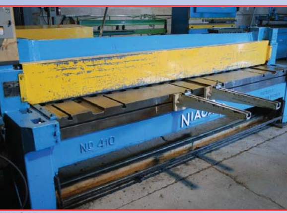
NIAGARA POWER SHEAR MODEL NO 410, 10' X 14 GAUGE CAPACITY