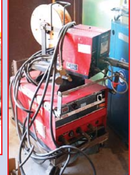
LINCOLN ELECTRIC DEALARC WELDER MODEL CV-250