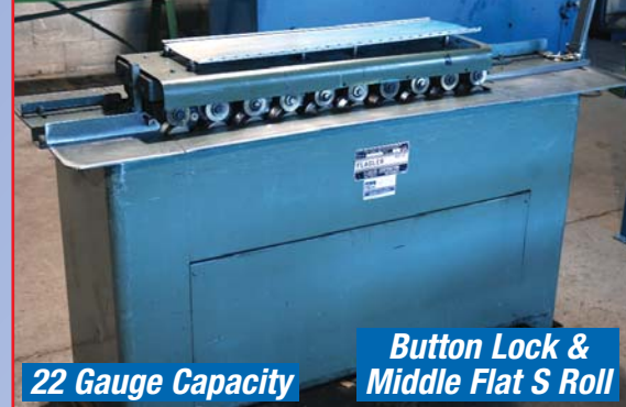
FLAGLER MODEL HSCL ROLL FORMER