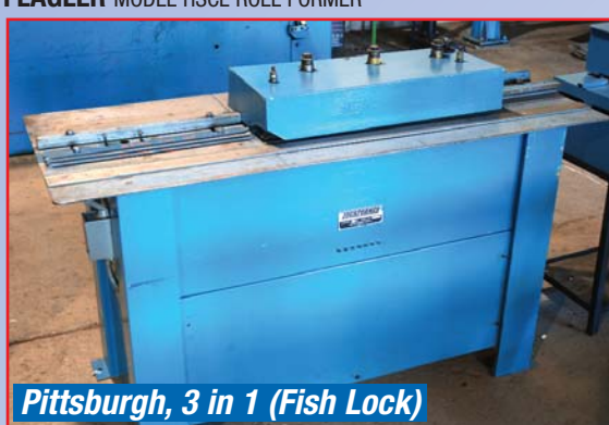
LOCKFORMER 16 GAUGE