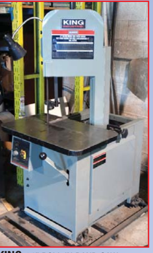
KING 14" ROLL IN BAND SAW MODEL KC-914H