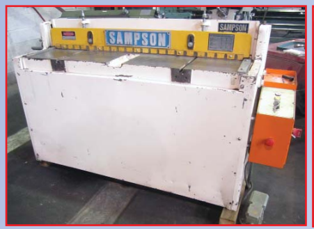
SAMPSON 4'X 14 GAUGE HYDRAULIC SHEAR, MODEL LB-414H